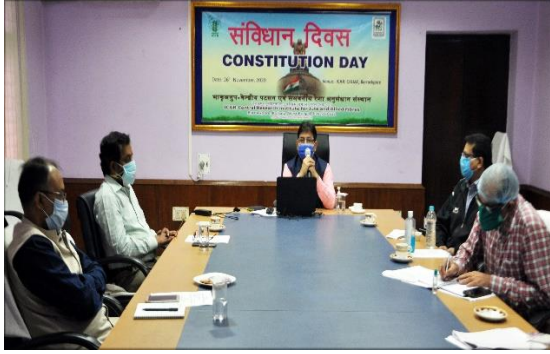
Concluding remark by the Director