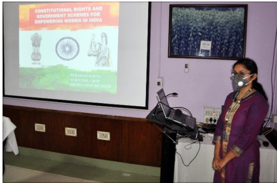
Lecture on Constitutional provisions for women empowerment