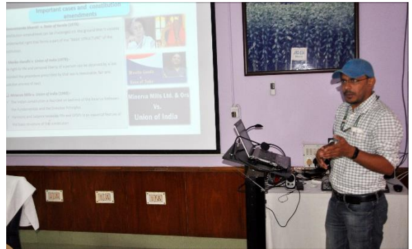
Lecture on preamble and fundamentals of Indian Constitutional